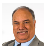
Mohammad Asghar South Wales East Welsh Conservative Party